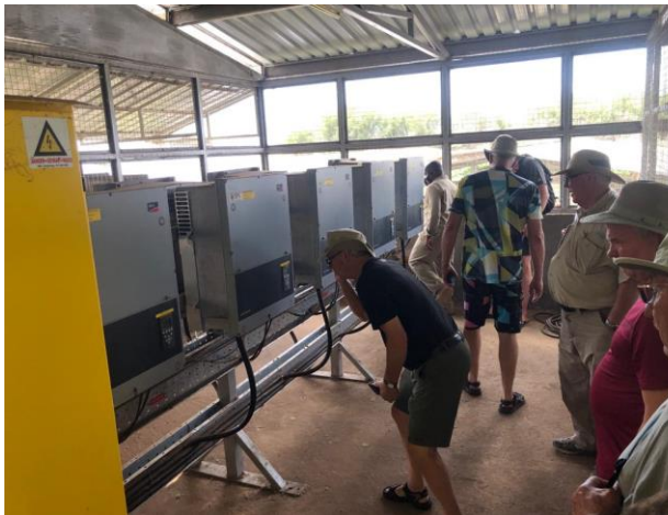
ECAA members attend a tour and demonstration of a solar power installation in the Kenyan Savannah.